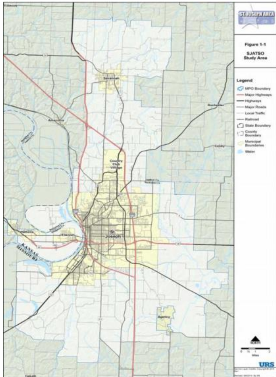
Figure 1: SJATSO Metropolitan Planning Area

The Transportation Improvement Program (TIP) documents the metropolitan region prioritization of limited transportation resources available among the various needs of the region. It is a program and schedule of intended transportation improvements (or continuation of current activities) for the next four (4) years, developed as part the regional planning process for federal funds received from the Federal Highway Administration (FHWA) and the Federal Transit Administration (FTA), as well as regionally significant